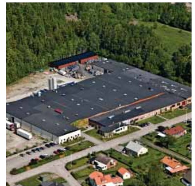
LK Pex production site in Ulricehamn, Sweden.

Our world-class Development Department has several times developed excellent new products and techniques. Being first on the market is one of the reasons for LK Pex' success.