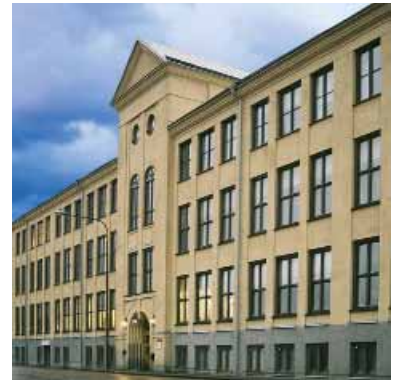
Lagerstedt & Krantz's head office in Stockholm, Sweden.

Established in 1998, LK Pex was founded as a new company within the LK Group with the aim of manufacturing PE-Xa pipes to serve the needs of LK Systems, one of the largest under floor heating companies in Scandinavia. From its manufacturing site in Ulricehamn (a small town 100 km east of Gothenburg), LK Pex is now producing pipes for customers throughout Europe and as far away as the USA and the Middle East.